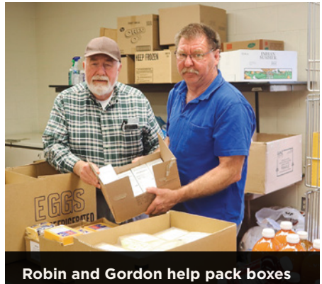
full of food.

In Carroll County, nearly 4,000 people, including 18% of children, may face food insecurity this year. Loaves and Fishes opens their pantry doors several times a month to ensure that families experiencing hunger have food on the table. Each month they serve nearly 200 families through a grocery store-like setup, allowing people to choose what food to take home.