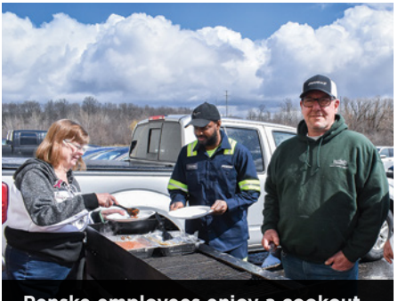
Penske employees enjoy a cookout while also raising funds for the Harvest for Hunger Campaign.

The local Penske facility in Macedonia stores and manages the supply chain for Starbucks stores in Ohio and neighboring states. Penske oversees the inventory of the prepared food available in stores, including breakfast sandwiches, lunch boxes, sweets and more. Sometimes, there's a surplus of these items and rather than send them to the landfill, this nourishing food is donated to the Foodbank. In 2021, Penske donated 52,000 pounds of food to the Foodbank, helping provide more than 43,000 meals for Northeast Ohioans.