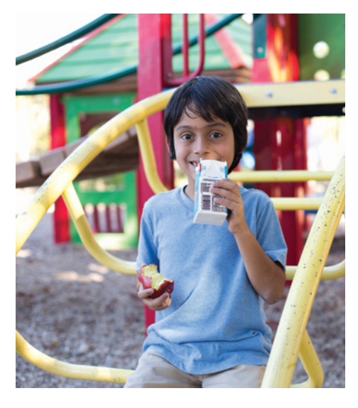
Thank you for helping provide meals to children during summer break.

Food pantries will serve as a much-needed resource for these families and will help them make ends meet. Many of these hunger-relief programs will see an increase in use during the summer months.