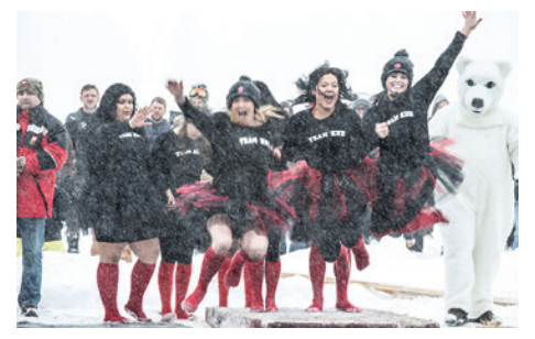
Employees from the Law Offices of Kisling, Nestico & Redick take the plunge