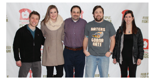
Akron RubberDucks staff before volunteering