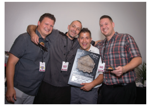
Savor from Canton was crowned the People's Choice Award winner at the event by serving blackened dry sea scallops over purple polenta with blue cheese and candied bacon, garnished with wheat grass.