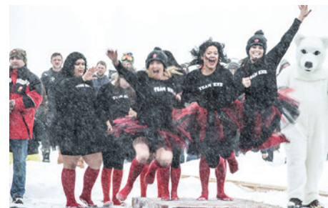
Employees from the Law Offices of Kising, Nestico & Redick take the plunge