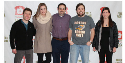
Akron RubberDucks staff before volunteering