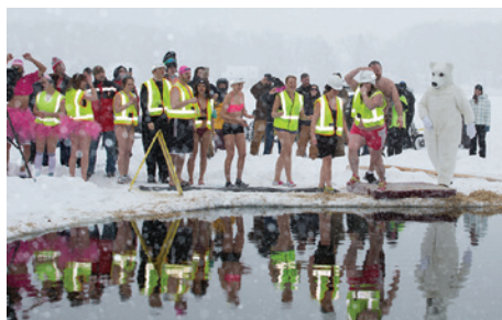
FirstEnergy Corp. employees prepare to jump