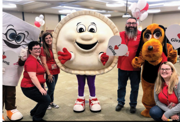
Foodbankers joined J.M. Smucker Co. employees to pack Thanksgiving bags for Akron families.