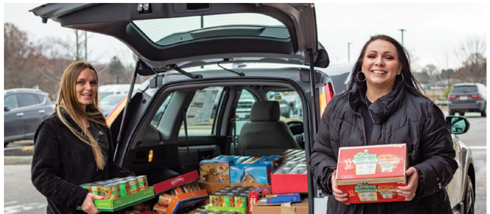
Great Lakes Honda coordinated a food drive to support the Holiday Campaign.