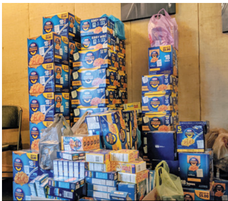
Rock 106.9 listeners helped donate a mountain of macaroni and cheese.