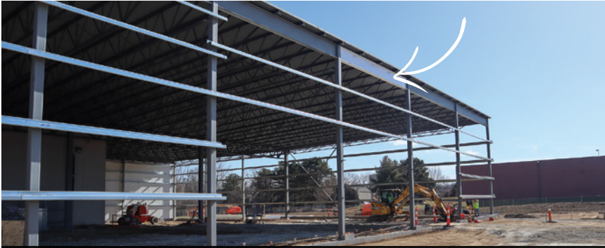
Community members made their mark on the Foodbank's history by signing the white construction beam earlier this year.

The Foodbank was excited to welcome guests to its Main Campus in Akron for a beam signing event. Guests had the opportunity to sign a 21-foot beam that has already been erected in the new expansion. The event commemorated the second phase of the organization's capital campaign project and renovation of its Akron facility.